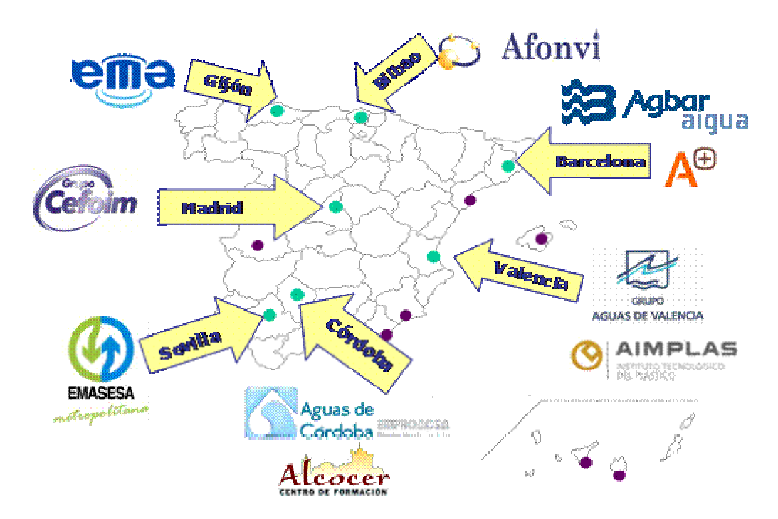
Imagen II: Training entities and place where courses have been organised

The course can take place not only at the training centres endorsed by AseTUB, but also on demand, at the client facilities on condition that the course is completely developed as in the training centre and the same education quality is maintained.