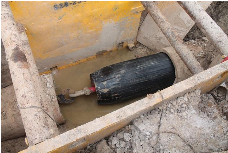
Trenchless refurbishment of old metal pipeline by “sliplining” with PE100.