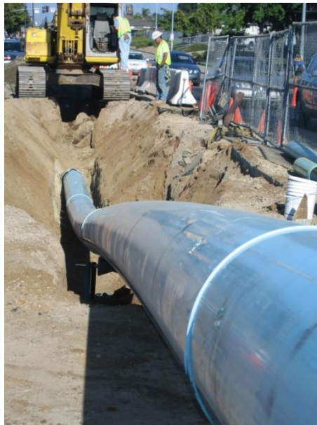
Trenchless refurbishment of old pipeline with welded PE100 pipes.